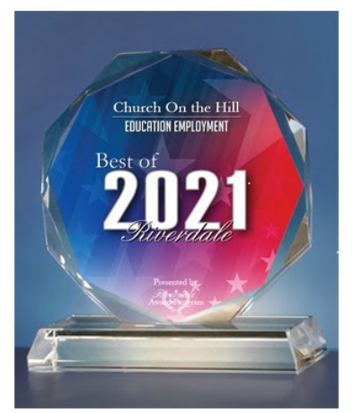
Winner of the 2021 Education Employment Award - Riverdale, MD